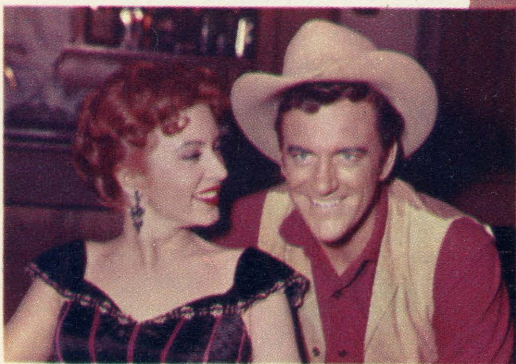
Arness in action: above, with Amanda Blake, Gunsmoke's dance-hall queen. At right, as Marshal Dillon he shoots to kill.

Arness paused, then continued sheepishly. "Fact is, I couldn't land another job in Holly- continued