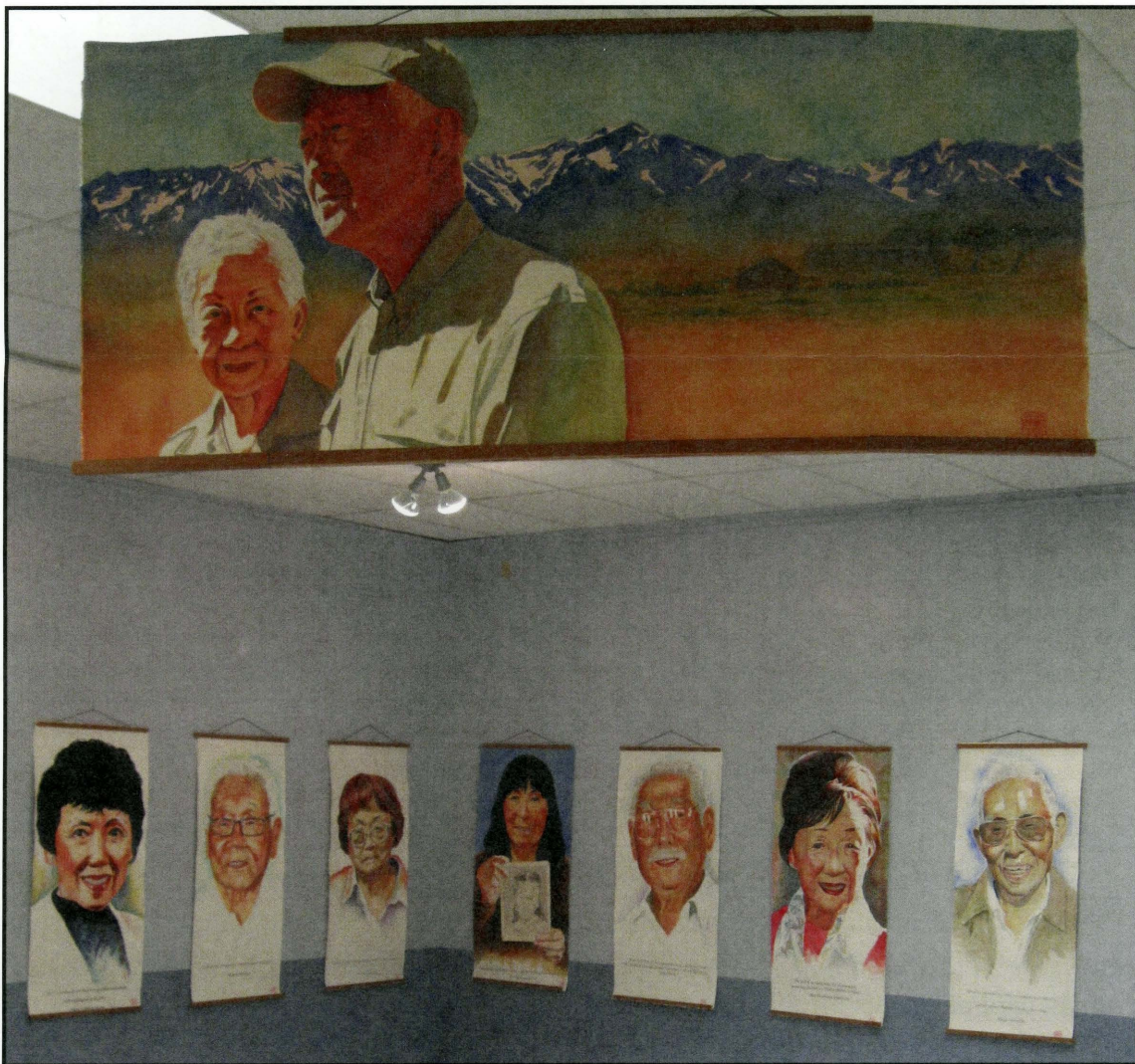
Faces of Incarceration, a recently installed exhibit at the Eastern California Museum

Faces of Incarceration, a unique collection of artwork showing portraits and quotes from Manzanar incarceratedees, is now on display at ECM. The quotes show a full range of perspectives from the people who were so intimately impacted and, coupled with current-day portraits, the exhibit significantly expands our understanding of the complexities and challenges related to Japanese-American incarceration. A program focusing on this exhibit will be held in January. The date and other details will be provided via email, or you can call the Museum at 760-878-0258.