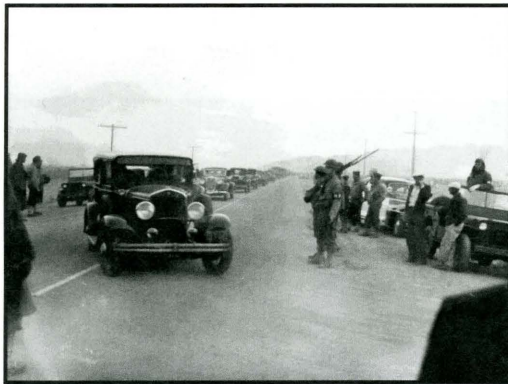
First of 10,000 incarceratedees arrive at Manzanar on March 23, 1942.

Also related to the Museum's Manzanar collection, the Museum digitized many of its Manzanar documents and photographs under a federal subcontract with California State University, Dominguez Hills. A scrolling digital exhibit at the Museum's Manzanar wing shows a fascinating view of the documents. This is extremely important for historical preservation, as these items were donated to the Museum by former incarceratedees prior to the establishment of the Manzanar National Historic Site located just a few miles south of Independence.