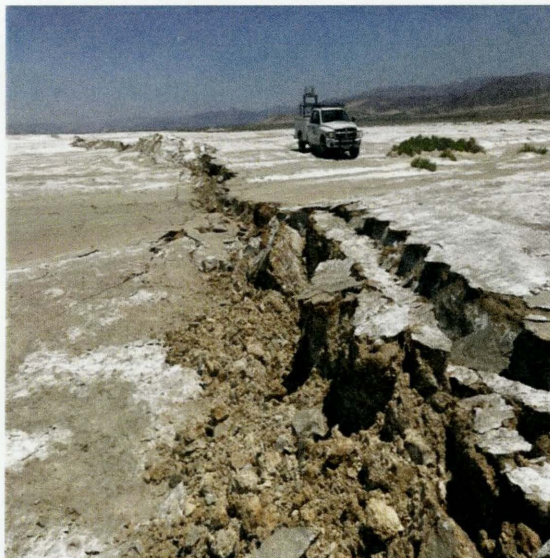
Zone of maximum surface displacement resulting from the 7.1 magnitude Searles Valley Earthquake. This was the largest earthquake to strike the Ridgecrest area during July 2019.